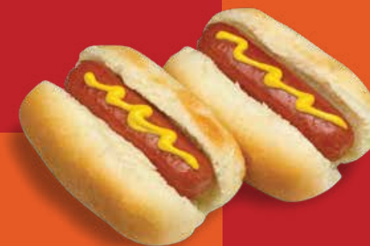
Pups - Only 3 Inches Long!

For more retail information, contact your local Vienna Beef Sales Representative.